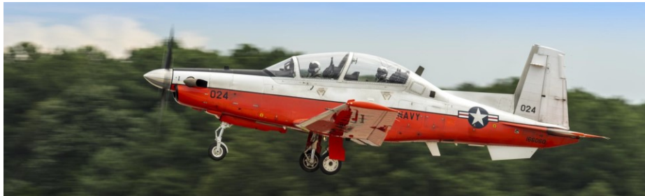
Figure 1 – US Navy Test Pilot School T-6B ( https://www.navair.navy.mil/nawcad/usntps ).

data tolerances or an unusual attitude. In contrast, a higher N_z point may simply involve a level turn across the horizon.