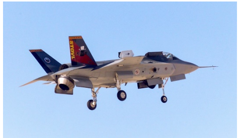
Figure 1 – Photo Credit: https://www.lockheedmartin.com/en-us/news/features/2019-features/the-hat-trick-history--mission-x.html

Does High Vis change the performance/behavior of the test team? Umm... Maybe.