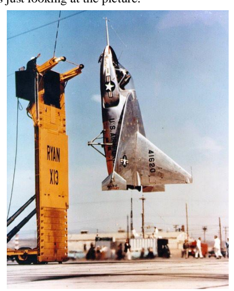
Ryan X-13 Vertijet

Aircrew: "It seems like every time I make this input the aircraft does this unexpected thing."